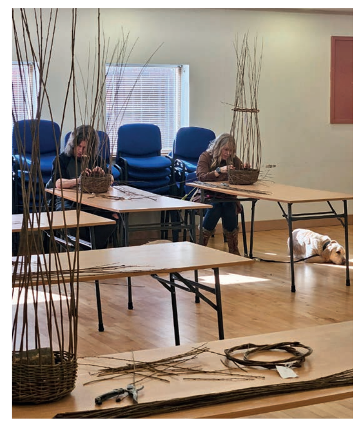
Image: Two people sitting at long tables working on weaving baskets while a dog lies in a sunny spot.

The monthly meetings are informal, friendly and everyone has an opportunity to give their thoughts and opinions. Books are supplied for free on an USB memory stick.