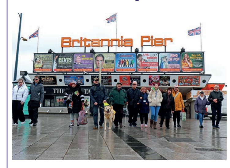
Image: Twelve walkers and one guide dog posing in front of the entrance to Britannia Pier on an overcast day.

Join a mini bus from Great Yarmouth for a trip from Wroxham to Aylsham on Bure Valley Railway followed by a water cruise on the Broads in Horning.