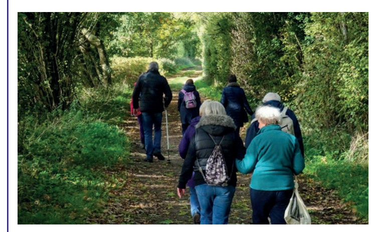
Image: A group of eight people from behind walking on a path through trees. Light breaks through the trees in places and there are leaves on the ground.

Join Vision Norfolk for an audio described performance of Carlos Acosta's brandnew production Nutcracker in Havana at Norwich Theatre Royal. Tickets cost £58 including a free sighted guide ticket if required. Book by 26th July by calling Mark on 01603 573000 Extension 341.