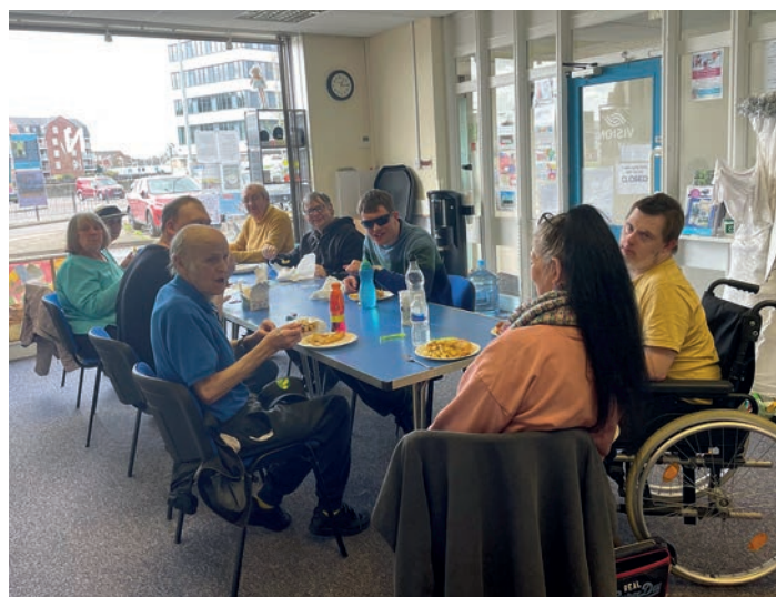
Image: Nine people sitting around a table in the Great Yarmouth Hub enjoying fish and chips as part of Fishy Friday.

The monthly Martham Coffee Morning has secured access to the full sized