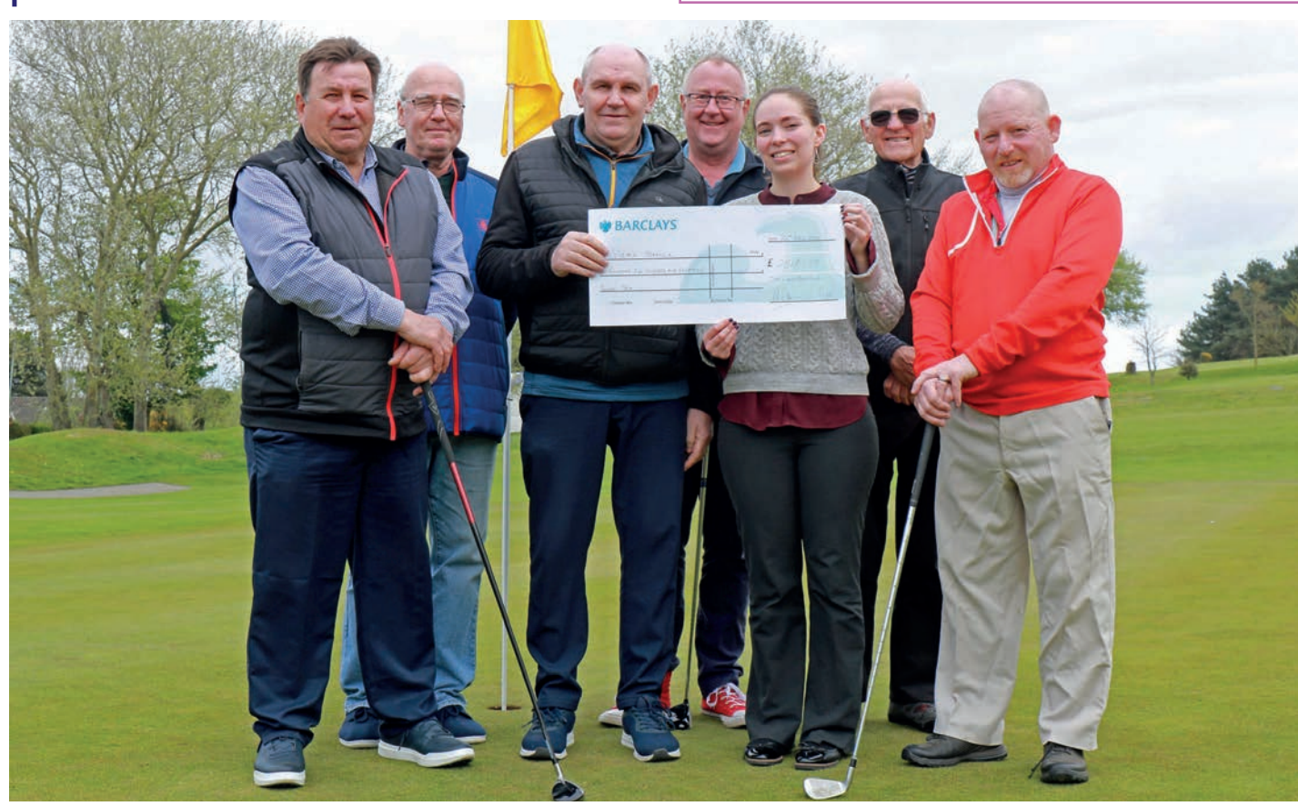
Image: Six members of the Links Golf Club in West Runton on the golf course handing over a cheque of £2514.04 to the Vision Norfolk Community Fundraising Officer

We want to say a huge thank you to all our supporters including: the Links Golf Club in West Runton, the 1st Corpusty and Saxthorpe Brownie pack, the Norwich City College Hospitality Enterprise Course, Acle Blind Club and many others!