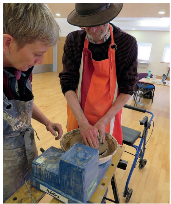
Image: A man standing at a pottery wheel while a woman stands next to him.

Jonathon Carrie from Norfolk Hedge Baskets ran a series of willow weaving