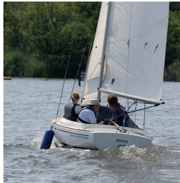
Image: Three people in a small sail boat on the Norfolk Broads. The boat has the name “Nessy” on the back and the website “www.nacyoldfield.org.uk” on the side.

Come stretch and relax with yoga. Sessions are designed to be accessible to all abilities and levels of experience.