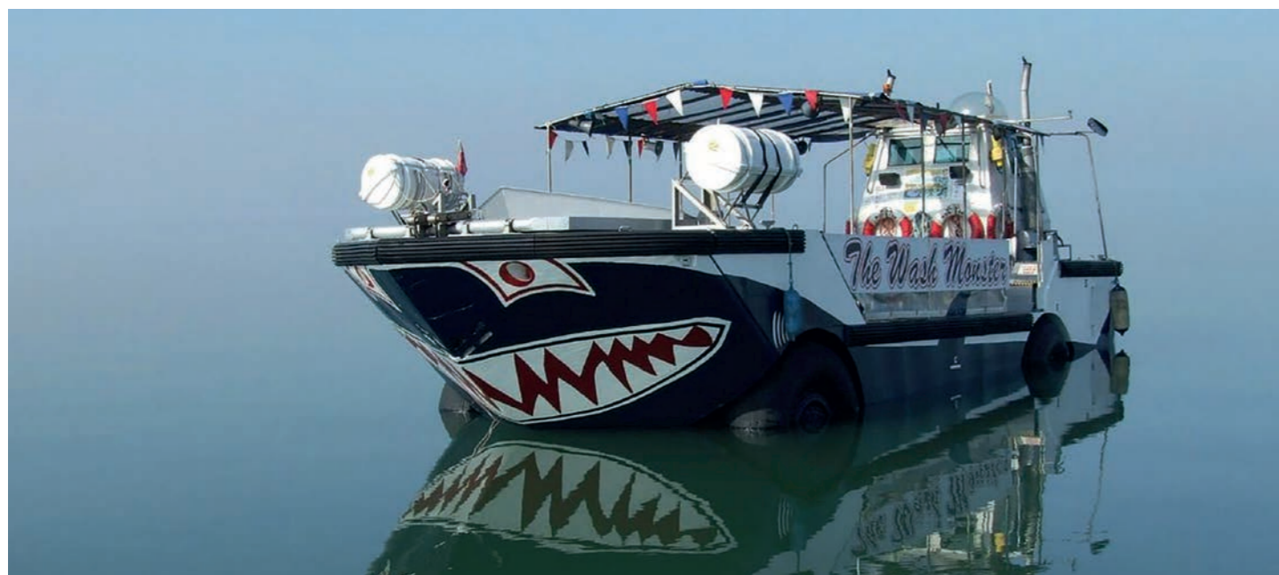
Image: The Wash Monster aquatic vehicle floating in the water. The vehicle has pointed teeth painted on the front and four wheels.

Our events and activities are designed to support the social wellbeing of local people with sight loss by allowing accessible opportunities for local people to meet up, socialise and learn new skills. If you have any questions or suggestions of how we can better support you please let us know!