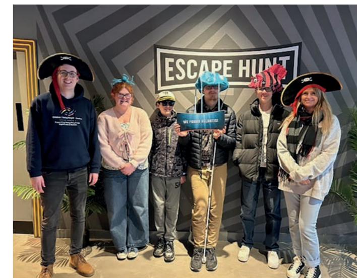
Image: Two staff members and four teens standing by the Escape Hunt sign. They are wearing ocean themed hats and holding a sign that says "We found Atlantis".

We always welcome your input and ideas, so if you have suggestions for new activities or ways we can enhance our support, please don't hesitate to reach out. You can contact us at CYPF@visionnorfolk.org.uk with any questions or ideas for 2025.