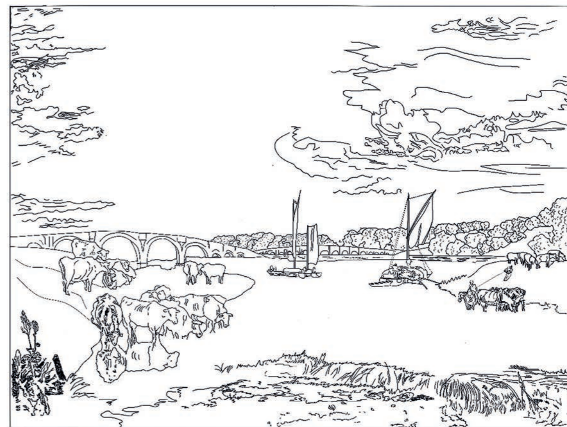
Image: An outline of the Walton Bridges painting by JW Turner, which was used to make a tactile representation of the piece. There is a bridge across a river with sail boats in the background and grazing cows in the foreground.

Our Allotment Project is taking shape now that the raised bed has been made and is awaiting a large delivery of soil. We are hoping to have a group visit before the end of March. Lots of ideas have been put forward as to what you would like to grow. If you are