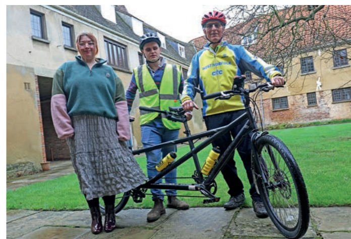
Image: A rider, a piolet (cycling guide) and a member of staff standing next to a tandem bicycle inside the courtyard of Thoresby College.

newsletter or get in contact with your local community hub to find out more.