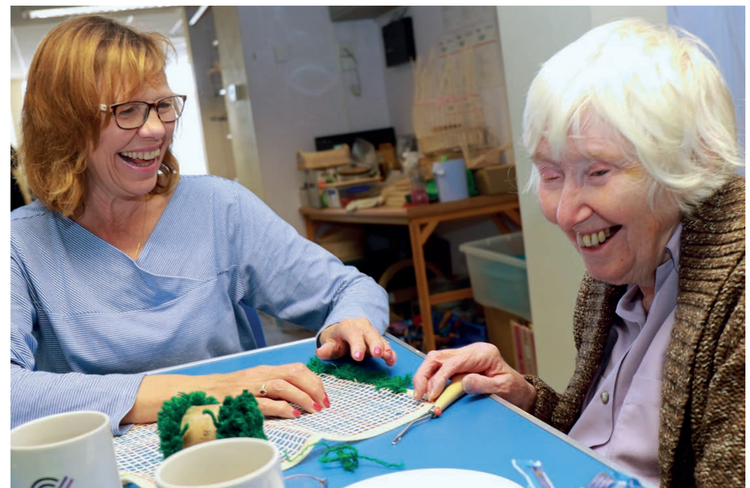
Image: Two woman sitting at a table laughing. In front of them is yarn and a mat with holes to make a small decorative rug.